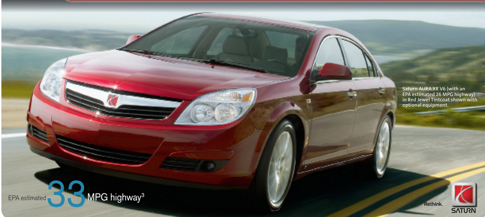
Saturn AURA XR V6 (with an EPA estimated 26 MPG highway) in Red Jewel Tintcoat shown with optional equipment.

The EPA estimated 33 MPG highway sport sedan. It offers best-in-class highway fuel economy; 1 a 5-star crash safety rating; 2 and still has all the room, comfort and refinement you want.