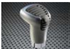
Shift Knob $75.00 Installed MSRP*