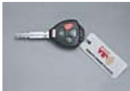
Remote Engine Start $529.00 Installed MSRP*