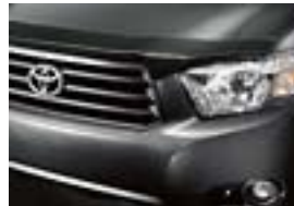
Hood Protector $155.00 Installed MSRP*