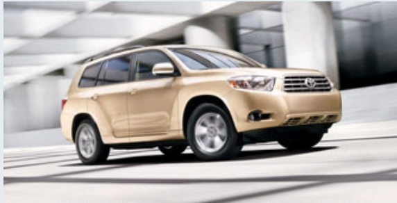
Highlander grade 4-cylinder shown in Sandy Beach Metallic with available roof rails and accessory roof rail with cross bars