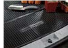
All Weather Cargo Mat $80.00 Installed MSRP*