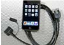
Interface Kit for iPod $299.00 Installed MSRP*