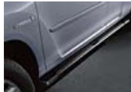
Running Boards $649.00 Installed MSRP*