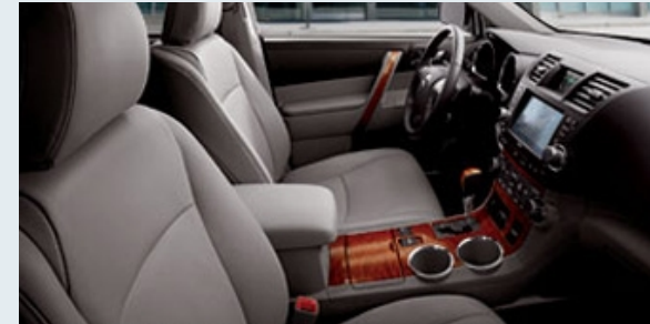
Limited shown in Ash leather trim with available voice-activated DVD navigation system [12] with JBL® AM/FM 4-disc in-dash CD changer and multi-stage heated front seats