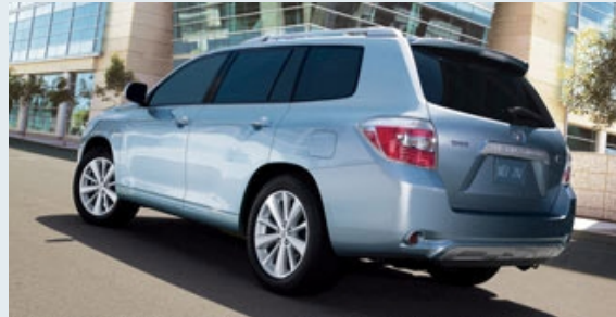
Highlander Hybrid shown in Wave Line Pearl with available Popular Package and accessory roof rail cross bars