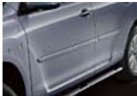
Body Side Moldings $199.00 Installed MSRP*