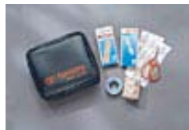
First Aid Kit $29.00 Installed MSRP*