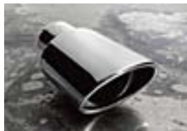
Exhaust Tip $75.00 Installed MSRP*