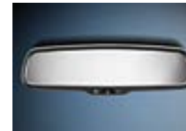
Auto Dimming Mirror $299.00 Installed MSRP*