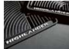
All Weather Floor/Cargo Mat w/ 3rd row Seat $230.00 Installed MSRP* w/o 3rd row Seat $185.00 Installed MSRP*