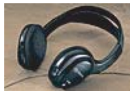
Wireless Headphones (pair) $82.00 Installed MSRP*

These interior accessories are also available: