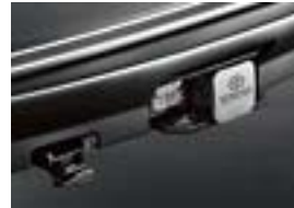
Tow Hitch w/Wire Harness $659.00 Installed MSRP*