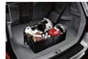
Cargo Tote by Nifty Products $40.00 Installed MSRP*