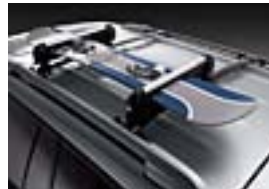
Ski/Snowboard Att. w/ Cross Bars Ski/Snowboard Att. $139.00 Parts Only MSRP** Cross Bars $229.00 Installed MSRP*