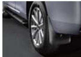
Mudguards $99.00 Installed MSRP*