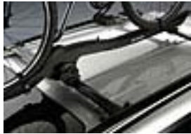
Bike Att. w/ Cross Bars Bike Attachment $189.00 Parts Only MSRP** Cross Bars $229.00 Installed MSRP*