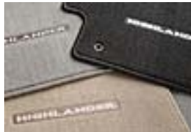
Carpet Floor/Cargo Mat w/ 3rd row Seat $275.00 Installed MSRP* w/o 3rd row Seat $230.00 Installed MSRP*