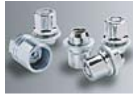
Wheel Locks $81.00 Installed MSRP*