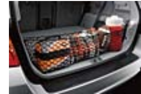
Cargo Net $49.00 Installed MSRP*