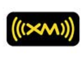
XM Satellite Radio $449.00 Installed MSRP*