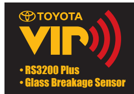
VIP Security Systems RS3200 Plus $359.00 Installed MSRP* Glass Breakage Sensor $247.00 Installed MSRP*