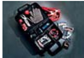
Emergency Assistance Kit $70.00 Installed MSRP*