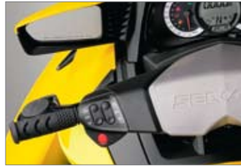
Brake & finger throttle