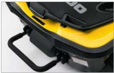
Fold-down reboarding step