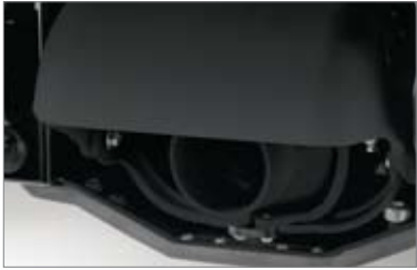
iBR (Intelligent Brake & Reverse)