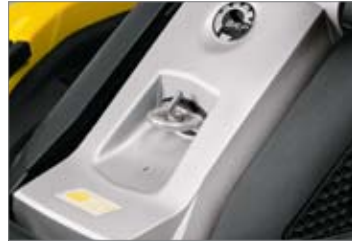
iS (Intelligent Suspension)